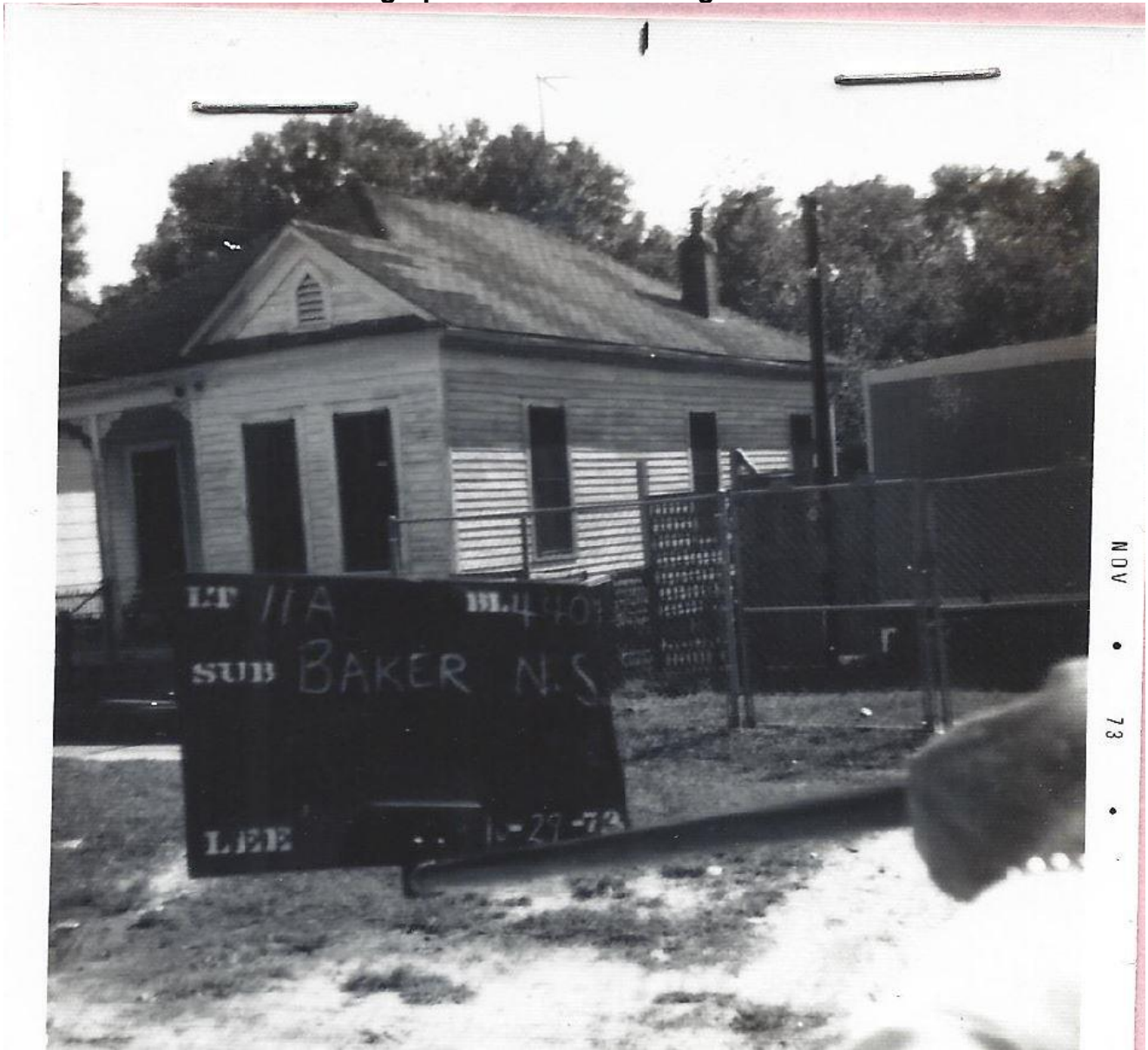
Historic Photograph from 1973 Building Land Assessment