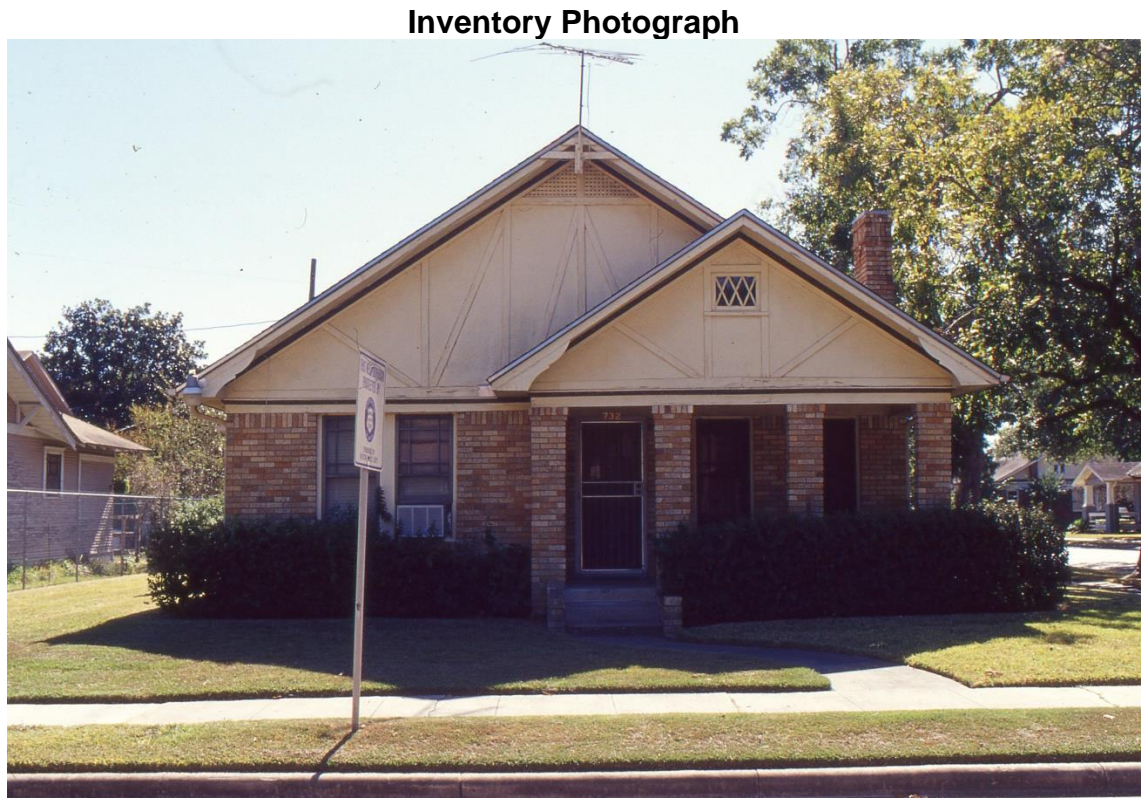
732 W Cottage St: Main structure