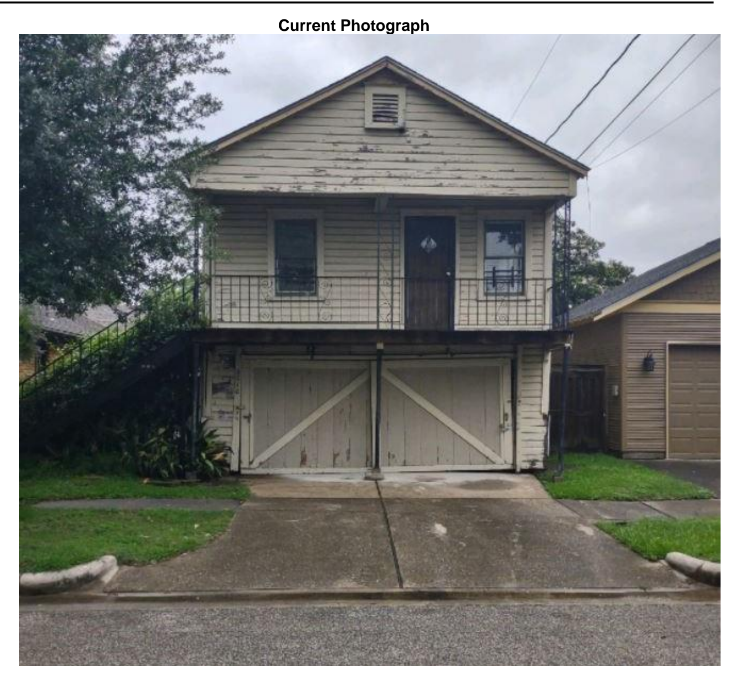
3810 Watson Street