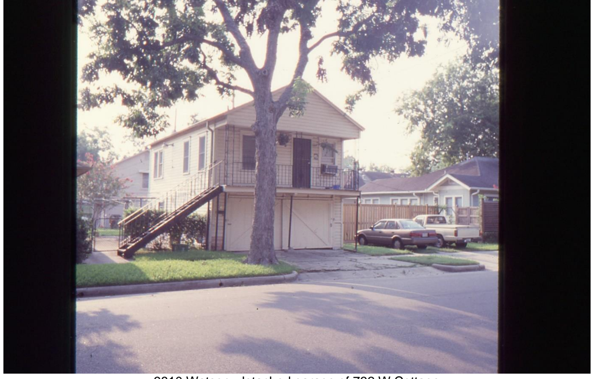
3810 Watson: detached garage of 732 W Cottage