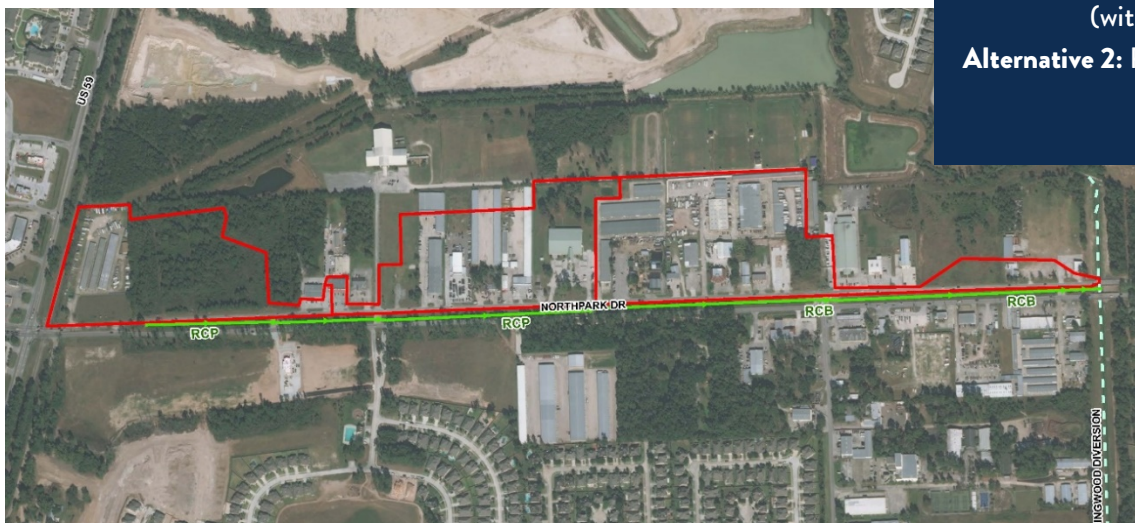
Proposed Northpark-Specific Drainage Improvement Concept

Alternative 2: Proposed Storm Sewer System (inline storage)