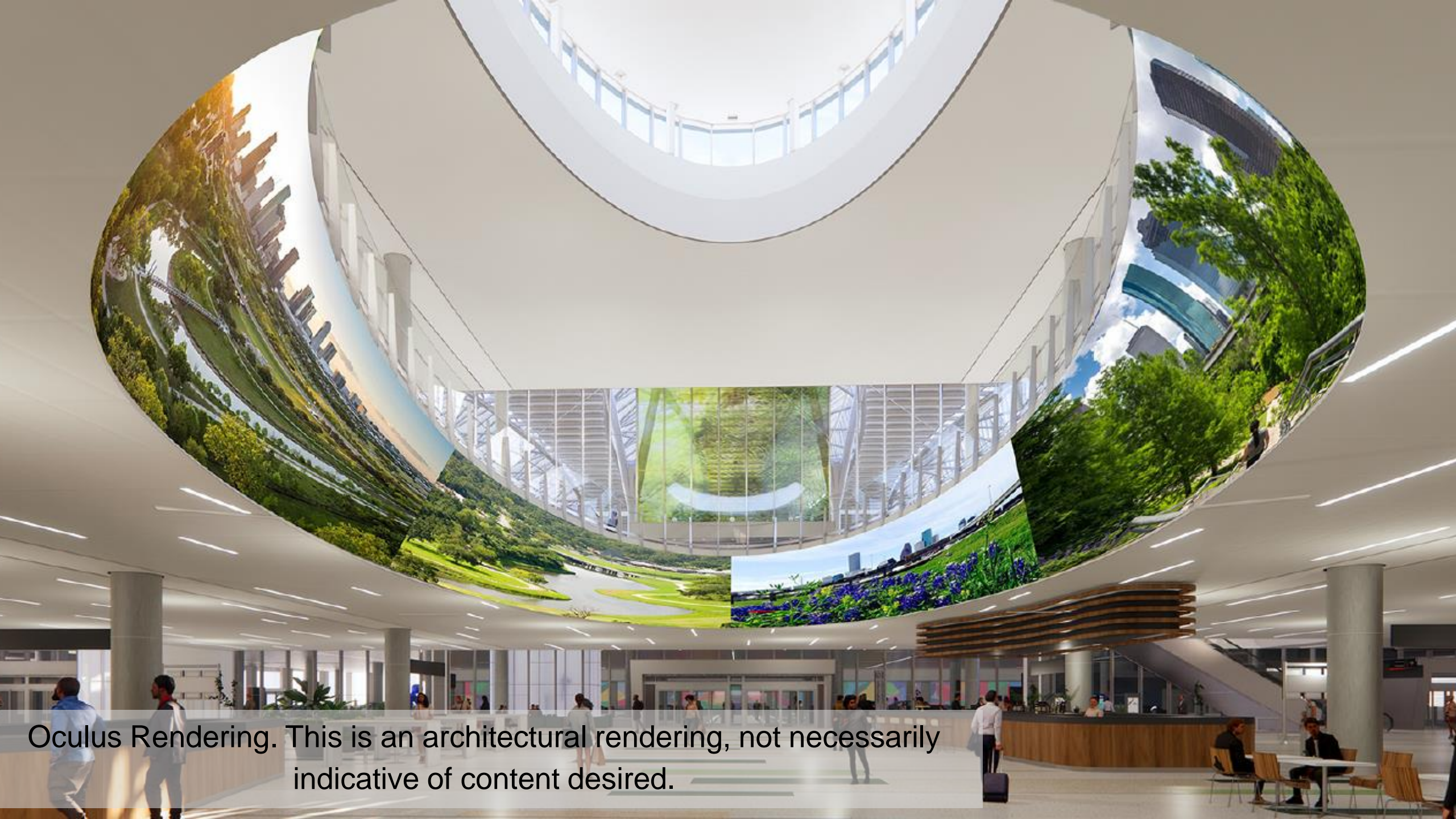
Oculus Rendering. This is an architectural rendering, not necessarily indicative of content desired.