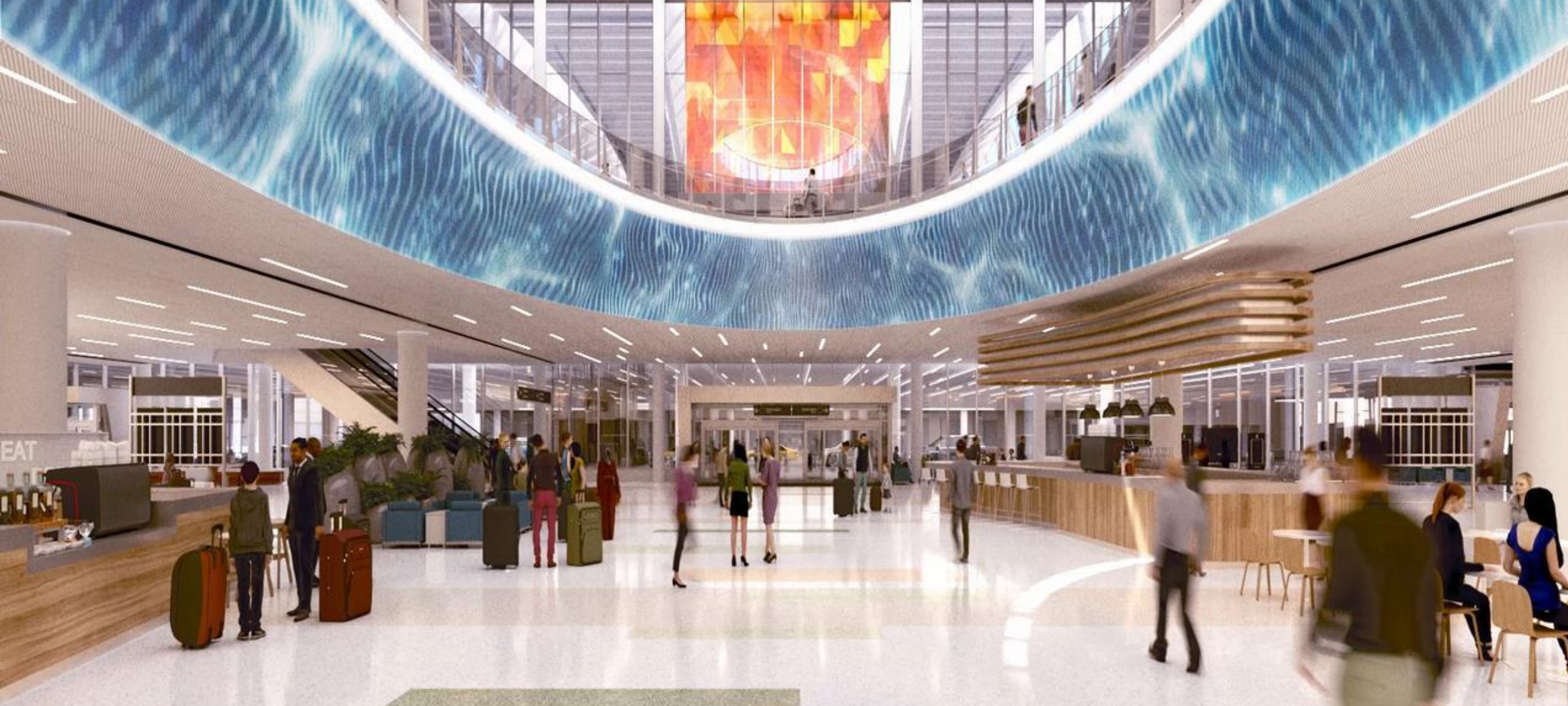
Oculus Rendering. This is an architectural rendering, not necessarily indicative of content desired.