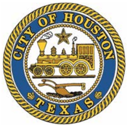
Mayor Sylvester Turner