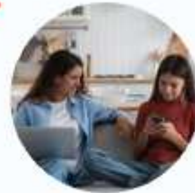
Parents & Caregivers