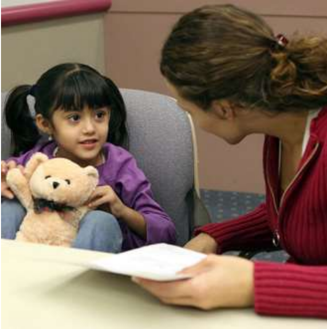
Texas Department of Family and Protective Services (DFPS)