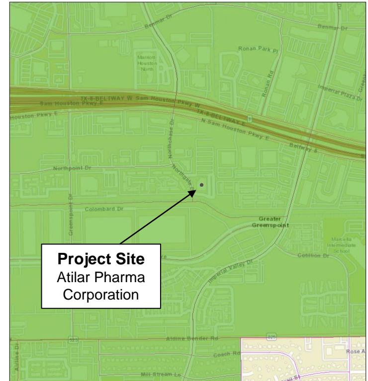
Atilar Pharma Corporation TEZ Site