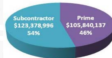
Total Awards to MSBEs

In FY 2012, with a citywide 22% MSBE construction goal, the City awarded a total of $706.5M in construction contracts. Of that amount, $229.2M was awarded to certified MSBEs, accounting for 32.4% of all construction contracts.