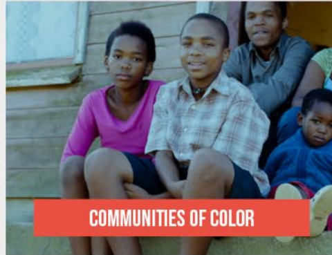
COMMUNITIES OF COLOR

40% of Houston's apartments were built between 1960 and 1979 when building safety regulations were especially lax. As of 2014, approximately 400,000 Houstonians (more than 20% of the city's population) lived in these older apartments.